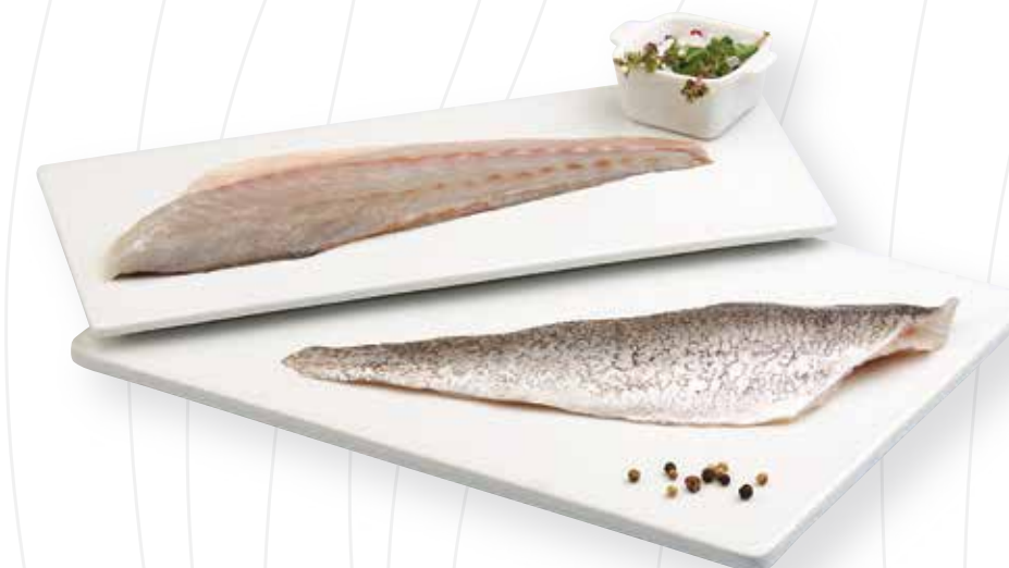
Fresh Meagre Single Fillet Skin On,PBI Frozen Meagre Single Fillet Skin On,PBI Sizes: 180/250-250/500-500/750-750/1000 gr.