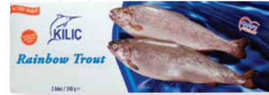
Frozen Gutted Rainbow Trout Retail Packed Sizes: 340 gr./box (150-200 gr.)