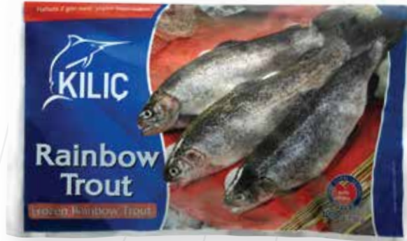
Whole Frozen Gutted Rainbow Trout Retail Pack Sizes: 1000 gr./Pack (200-350 gr.)