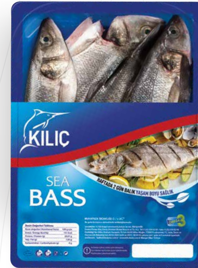
Whole Gutted Sea Bass Sizes: 200-300/300-400 gr.