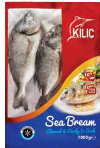
Whole Frozen Gutted Sea Bream Whole Frozen Gutted Sea Bass Sizes: 1000 gr.