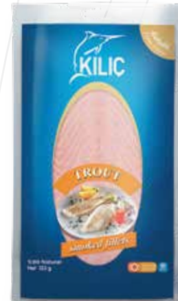
Frozen Smoked Trout Fillet Sizes: 60-125 gr.