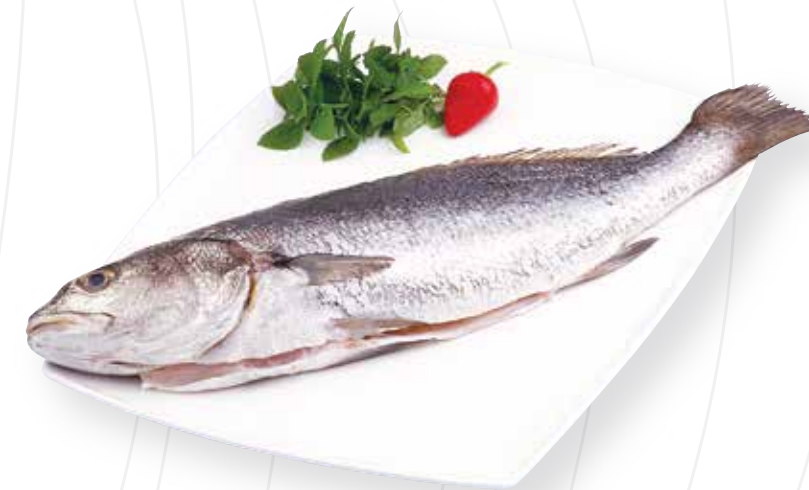
Whole Fresh & Guttred Meagre Whole Frozen & Guttred Meagre

Sizes: 800/1000-1000/2000-2000/3000-3000/4000-4000/5000 gr.