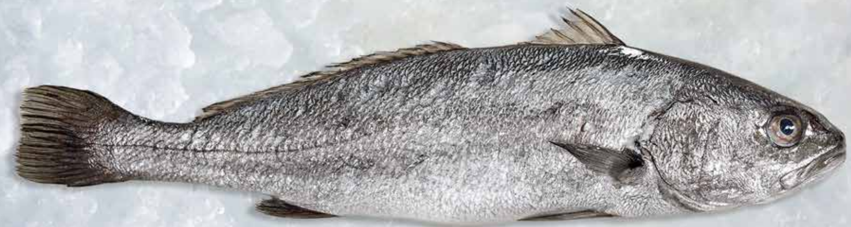
Whole Fresh & Chilled Meagre

Sizes: 800/1000-1000/2000-2000/3000-3000/4000-4000/5000 gr.