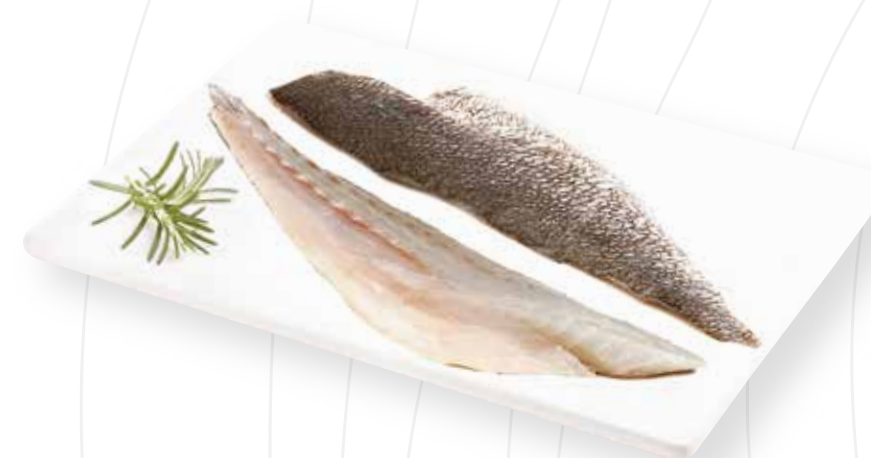
Fresh Meagre Single Fillet Skin On,PBO Frozen Meagre Single Fillet Skin On,PBO Sizes: 180/250-250/500-500/750-750/1000 gr.

Sizes: 800/1000-1000/2000-2000/3000-3000/4000-4000/5000 gr.