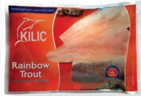
Frozen Single Fillet Rainbow Trout Retail Pack (Skin On) Sizes: 750 gr./bag (50/70-70/90 gr.)