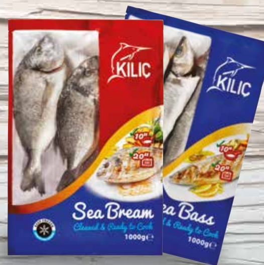
Whole Frozen Gutted Sea Bass

Grading: 60-125 g Packing: 5-10-15 kg Carton Boxes