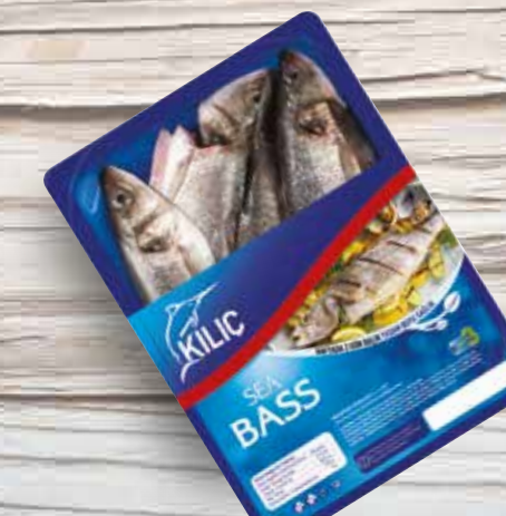
Whole Gutted Sea Bass

Grading: 50/80 g (201-300 g), 80/100 g (301-400 g) g/pieces Packing: 2-3-5-6-10 kg Polystyrene Fish Boxes