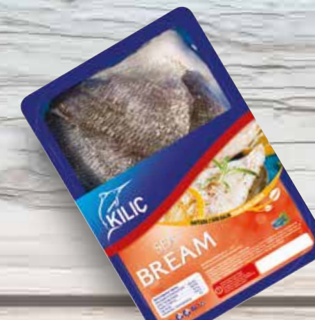
Sea Bream Fillet

Grading: 201-300 g/301-400 g/pieces Packing: 6-10 kg Polystyrene Fish Boxes