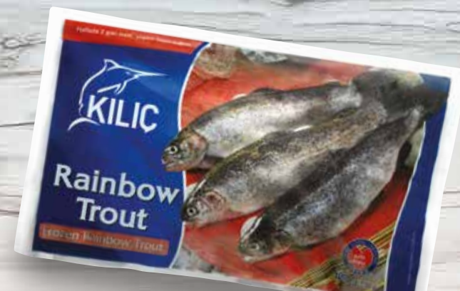
Whole Frozen Gutted Rainbow Trout Retail Pack

Grading: 1000 g/Pack (200-350 g/pieces) Glaze: %0-%5-%10-%15-%20 Packing: 5-10 kg Carton Boxes