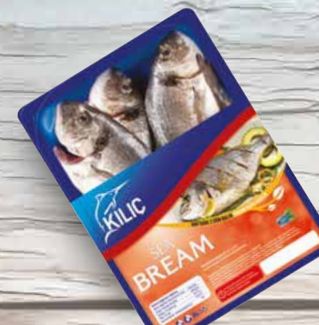
Whole Gutted Sea Bream

Grading: 201-300 g/301-400 g/pieces Packing: 6-10 kg Polystyrene Fish Boxes