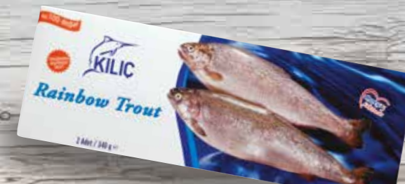
Frozen Gutted Rainbow Trout Retail Packed

Grading: 750 g/bag (50/70 g/pieces, 70/90 g/pieces) Glaze: %0-%5-%10-%15-%20 Packing: 5-10 kg Carton Boxes