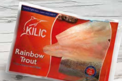
Frozen Single Fillet Rainbow Trout Retail Pack (Skin On)

Grading: 1000 g/Pack (200-350 g/pieces) Glaze: %0-%5-%10-%15-%20 Packing: 5-10 kg Carton Boxes