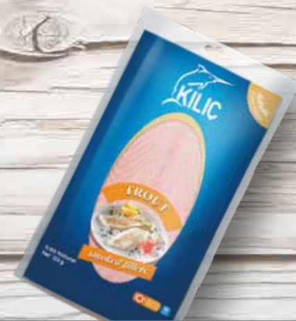
Frozen Smoked Trout Fillet

Grading: 340 g/box (150-200 g/pieces) Glaze: %5 Packing: 5 kg Carton Boxes