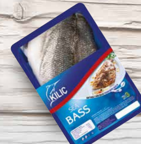
Sea Bass Fillet

Grading: 201-300 g/301-400 g/pieces Packing: 6-10 kg Polystyrene Fish Boxes